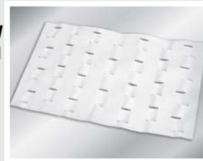
Panini Waffletechnology Check Scanner Cleaning Card

Waffletechnology Check Scanner Cleaning Cards designed for OEM's Equipment are designed with the equipment manufacturer for optimal cleaning performance. Available in boxes of 15 Cleaning Cards