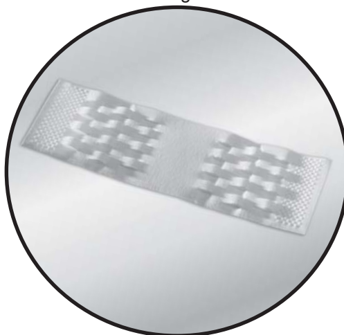
Waffletechnology MICR / Check Reader Cleaning Cards

Waffletechnology is an advancement in cleaning card technology. The Cleaning waffles are flexible raised platforms. These platforms allow the card to clean previously unreachable areas within the card reader. Now more dirt is removed making your reader cleaner and more reliable than ever before.