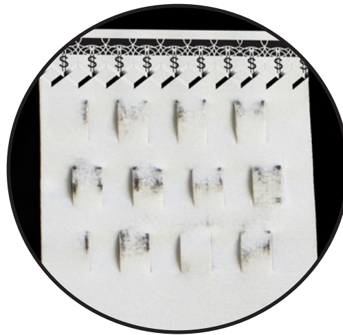
Lucky Stripe Waffletechnology Bill Acceptor Cleaning Cards

Waffletechnology is an advancement in cleaning card technology. The Cleaning waffles are flexible raised platforms. These platforms allow the card to clean previously unreachable areas within the bill acceptor. Now more dirt is removed making your validator cleaner and more reliable than ever before.